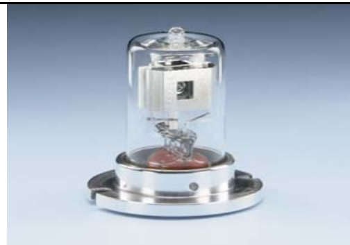
Waters 996, 2996 PDA Long Life Deuterium