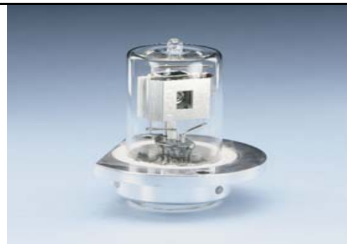
Shimadzu SPD10A Long Life D2

Premium quality lamps, available from stock with the highest level of technical support before and after the sale.