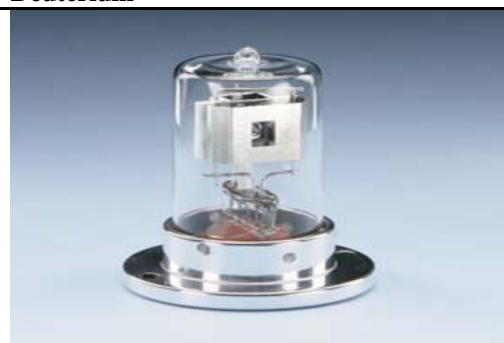
Waters Alliance 2487 Long Life D2