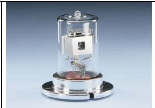
Gynkotek UVD 320/160/170S/340 DAD