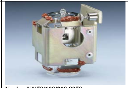
Varian UV50/100/200 9050 Prostar 310 D2 long life