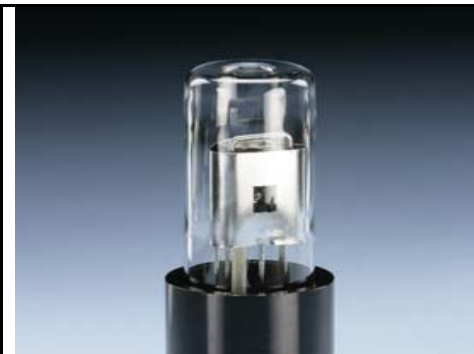
Gilson 115/116/117/118/119/151/ 152/155/156