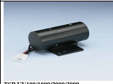
TSP UV100/1000/2000/3000 Linear Focus and 200 Series