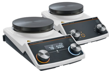
HEI-PLATE CORE AND CORE+