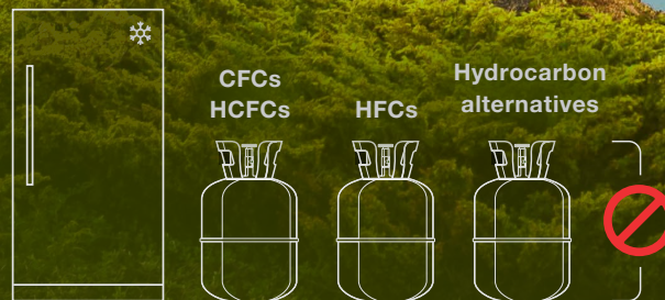
Other suppliers' refrigerators and freezers